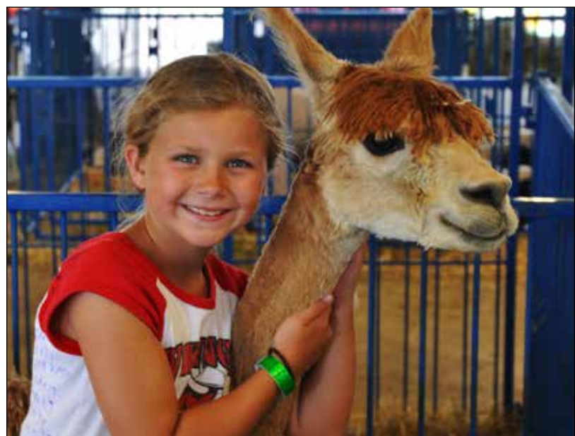
The City of Aurora established the Aurora Community Grant Program to make a difference in its community through grants to organizations like Special Olympics Indiana, Inc. (top) and Dearborn County 4-H Club Association (bottom).