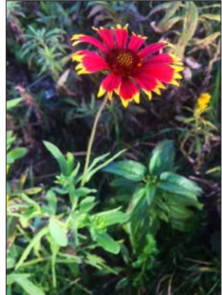
Donors contribute to DCF for a range of charitable causes to award scholarships and grants, like $4,447 to Oak Heritage Conservancy for its Hilltop Farm Nature Preserve walking trails in West Harrison.