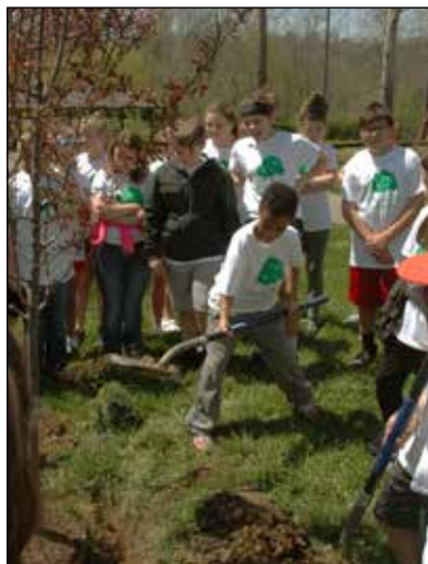
A $500 grant from the Sprint Educational Excellence Fund to the City of Greendale helped provide the Arbor Day workshop for elementary school students.